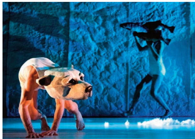
The dancers become mythical creatures inspired by the north.

Minière, Fanfare Pourpour and Pierre Lapointe. Two of his solo projects have been edited on the label Agrégats and on &records. He has been the invited composer at Pointe-à-Callière for the Port Symphony in 2014. This is his third collaboration with Théâtre Incliné. For NORDICITÉ , he created a rich and captivating sound environment inspired by the noise of the breaking ice in the north.